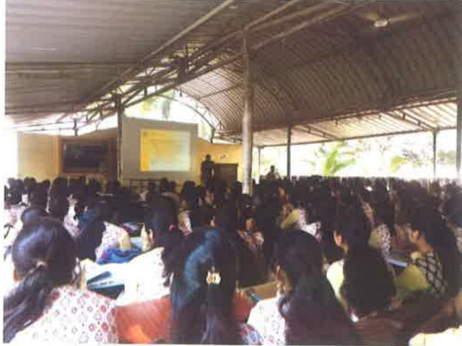
Question Answer Session and Feedback